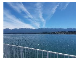
Flathead Lake in Montana